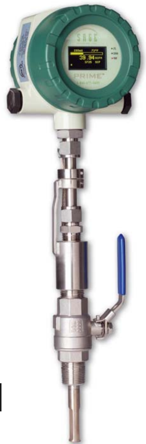
Sage Prime Pictured