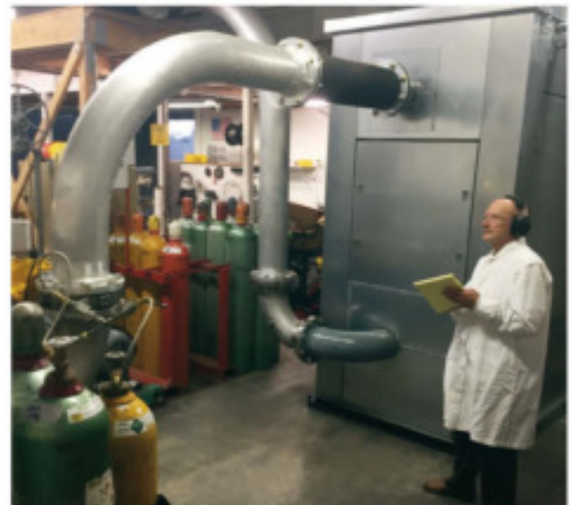
High Velocity Flow Facility