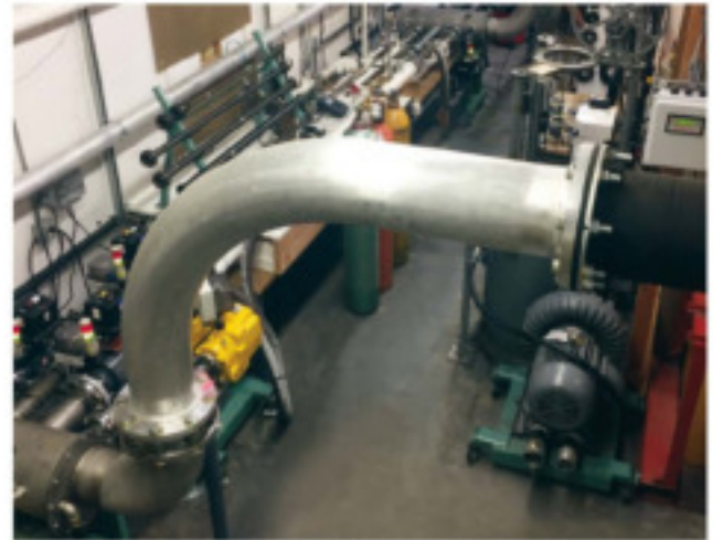
Main Intake to High Velocity Facility