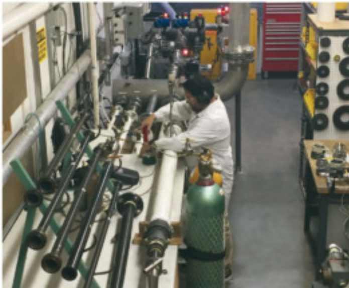
Automated NIST Traceable Calibration System

Provides accuracy of +/- 0.5% of Full Scale +/-1% of Reading over 100 to 1 turndown